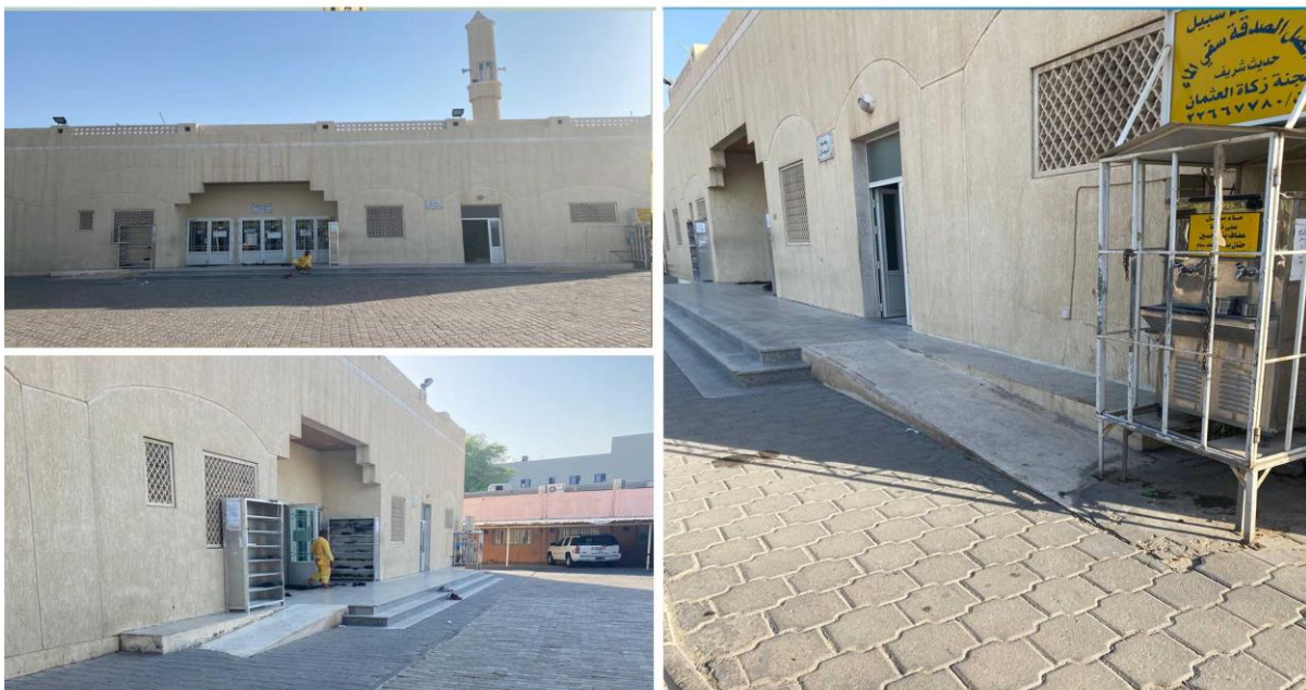
Figure 2. Al Balool Mosque at Hawally Governorate.