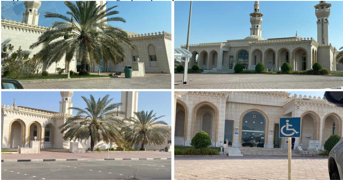
Figure 1. Al Rashid Mosque at the capital Governorates(the Author).

There is mostly a central mosque in each neighborhood in Kuwaiti and primarily located within the main public utility center that the government provides in each governorate. The author selected one main mosque from each of the six governorates of Kuwait, as these main mosques are the most used for daily prayers, plus the Friday congregational prayers. In doing so, the author sought to show a representative sample on the condition of mosque design in Kuwait.