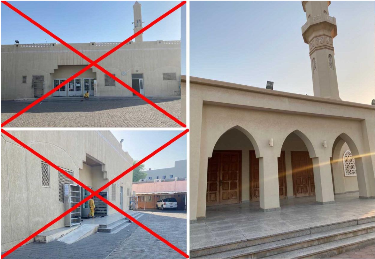
Figure 5. Douig Al Salman Al Sabah Mosque at Ahmadi Governorate (the Author).