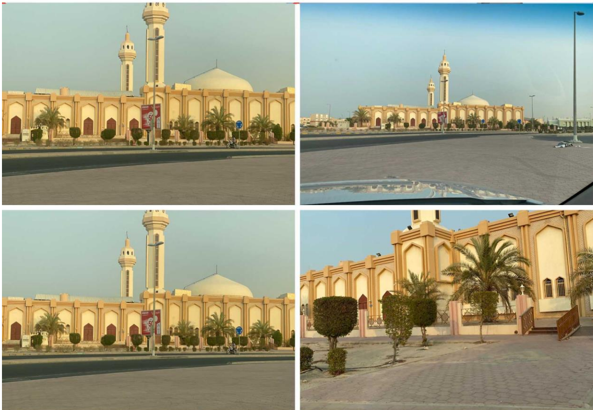
Figure 6. Omar Ibn Omair mosque at Mubarak Al-Kabir Governorate (the Author).