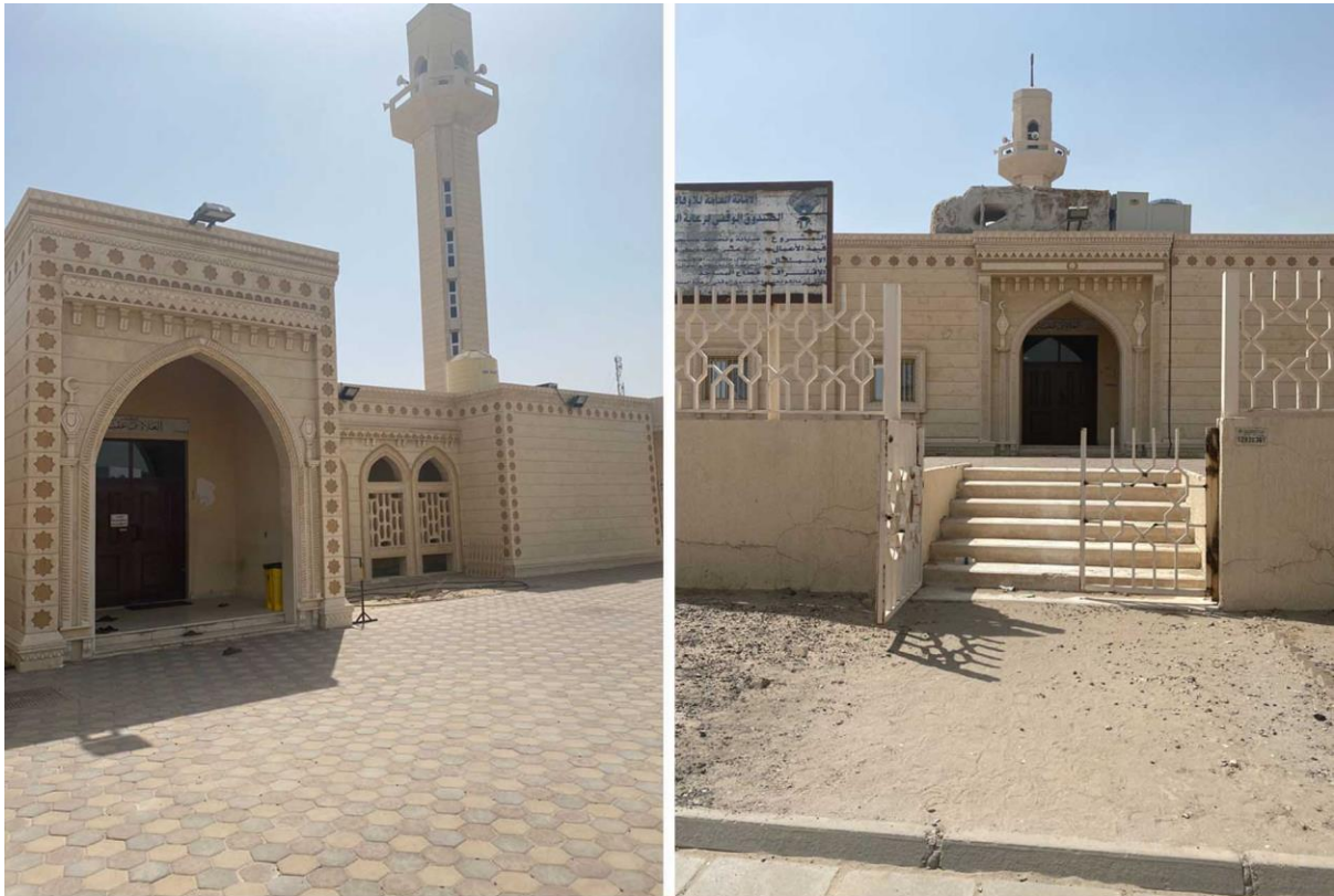
Figure 3. Al Ala Ibn Oqba Mosque at Farwaniya Governorate.