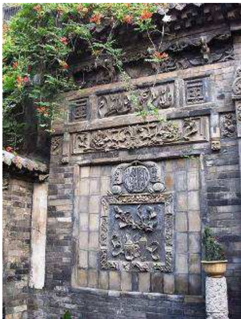
Figure 10. The calligraphic inscriptions are carved on stone in form of fruit and flowers with floral motifs.

Inscriptions are also found on the wall of Garden House which is place for resting and relaxing equipped with benches with landscape. The calligraphic inscriptions are written in form of fruit and flowers carved on stone with floral motifs which is integrated with landscape the garden (figure 10). According to table 2, the theme of these inscriptions can be classified into: remembrance of God, role of mosque, confession of faith teaching of Islam about good deeds, purification and fear of God (table 2).