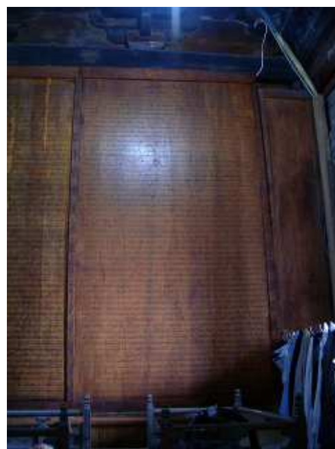
Figure 4. The full text of Qur'ān is carved on wooden panels at Xian Great Mosque

The inscription started with Bismillah, surah 1 and then surah 2 followed up to surah 114, since there is no break in the Qur'ānic text, it implies that the original idea was to have the Qur'ān itself inscribed from beginning to the end. One may add that in spite of the fact that it was not complete, it was always regarded in popular and folk account that the mosque contained the whole Qur'ān. But the fact that it displayed the full text of Qur'ān is a main difference between Xi'an Great Mosque and other old mosques of Muslim land. The carved inscription of the full Qur'ān on wooden panels gives the mosque a unique character that differentiated from other mosques of the Muslim world (figure 4).