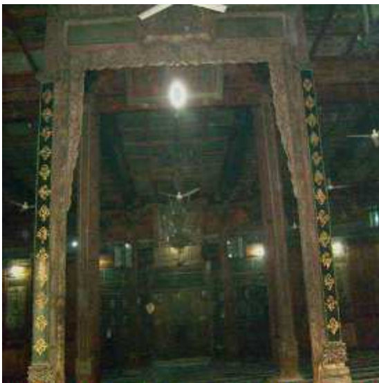
Figure 5. The calligraphic inscriptions in form of couplets hang on the pillars of central bay in Xi'an Great Mosque

The other couplets are inscribed with respected thirteen attributes till the end of the 99 attributes of God.