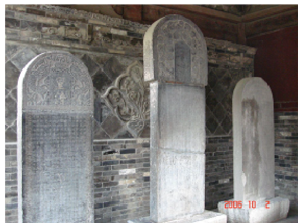
Figure 9. The carved stone inscriptions in three tablets are inscribed in three languages Arabic, Persian and Chinese language

The stone inscriptions in three tablets are inscribed in three languages Arabic, Persian and Chinese language. From the stone tablets indicate that Xi'an Great Mosque was originally set up in 742 AD during the Tang Dynasty. Holding the history of 1250 years, this complex had undergone several restoration and renovation during different dynasties such as Song, Yuan, Ming and Qing dynasty (figure 9).