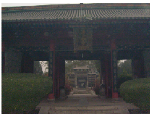
Figure 3. The influence of Chinese architectural style on Xi'an Great Mosque, China shown in the components of the mosque and its roofing

Contrasting with any other mosques, the layout of Xi'an Great Mosque has much influence of Chinese temple. It has series of courtyards in a single axis with pavilions and adapted to suit Islamic function (figure 3). However, different from other temple buildings in Chinese architecture, main axis of this mosque is aligned from the east to the west, facing Mecca.