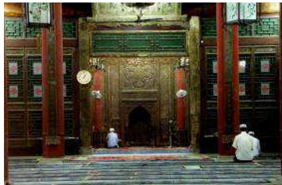
Figure 6. An Interior view of the prayer hall and its stylistic calligraphic decoration

of wood carving using calligraphy and floral motifs, the mihrāb is in concave shape, as in all mihrābs, and is located in the qiblah wall of the mosque. The artistic technique was used in the decoration of the mihrāb wall was mainly wood carving with Arabic inscriptions as well as geometric patterns and floral motifs that form a frame around the mihrāb and also appear in the bottom part of it (figure 6). However, the interior of the niche, is divided into an upper and lower section by bands of wood carving, the upper section has alternately coloured and plain vertical triangles which meet below the apex of the arch at a lotus. The lower part is carved with floral motifs. The mihrāb wall is framed by a wooden panel carved of floral motifs integrated with two small inscriptions in two circular frames, which read الله غفور، الله عفو which means God is Amnesty, God is forgiving.