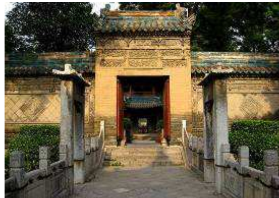
Figure 8. View of calligraphic inscriptions at courtyards which were carved on stone

activities. These facilities such as room for association meeting, room for important official guests, rooms for ablution and others for exhibitions for manuscripts and artefacts. However, all these facilities are located outside the prayers hall at the courtyards of the mosque, each facility contains calligraphic inscriptions, and the subject of these writings can be derived from different sources in Islam. (figure 8).