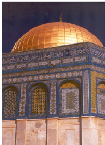
Figure 1. The first use of inscriptions on religious buildings was on the Dome of the Rock

The study of epigraphy has been commented upon and evaluated by R. Ettinghausen and others 2 . In these evaluations, it is put forth that the importance of architectural inscriptions for the study of architectural history as well as cultural and social history. By the time the Mamluks raised the power in 1260 AD, the use of Arabic inscriptions on architectural buildings had become a traditional form of visual communication. Though the use of inscriptions on buildings is dates back to the first monument in Islam, the Dome of the Rock (691 H), the root of Mamluks practice lie in the Fatimid tradition in Cairo and its interpretation by Ayyubids after them 3 (figure 1).