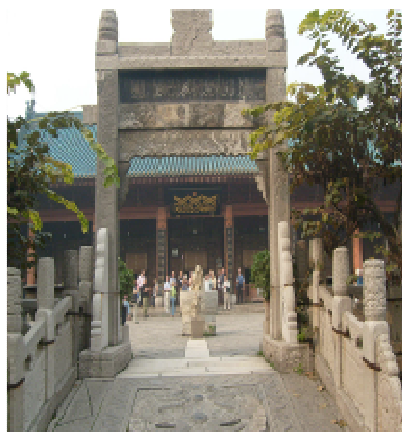
Figure 2. View of Xi'an Great Mosque that serves as a centre for religious, political and social activities of Hui Muslims

The Great Mosque of Xi'an as it referred to by Muslim Chinese official sources, is the oldest mosque in China and hypostyle, courtyard ever built in mosques of China. The significance of its architecture is attributed to its artistic merit, its place in the history of Muslim China, in its unique style, and its role in religious life of Muslims in Xi'an city (figure 2). In 1956, the mosque was declared as an important national historical and cultural site by the government of the People's Republic of China. The Great Mosque also is preserved under the China Conservation Unit and United Nations Educational, Scientific and Cultural Organization (UNESCO).