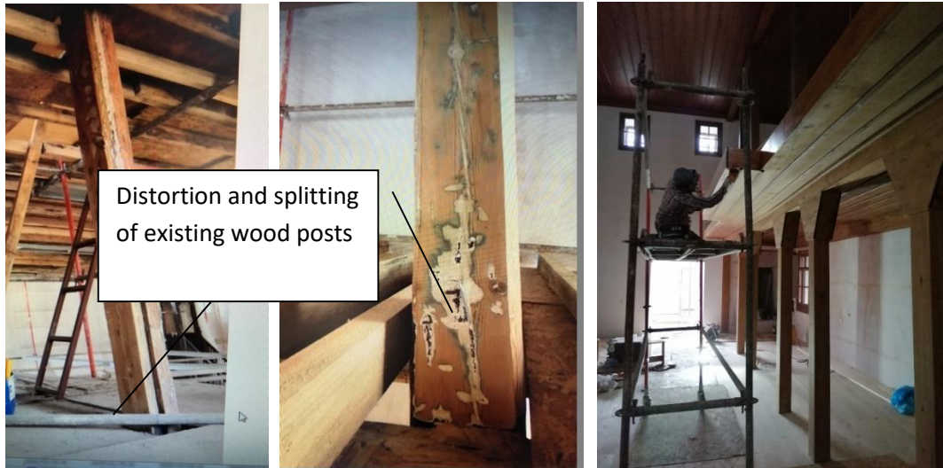
Figure 12. Distortion and splitting of existing wood posts and new posts and ceiling [16]

Following the start of the restoration work, a research was conducted in the archives of the Conservation Regional Council and old photographs of the building were obtained (Figure 13). In line with the data obtained, the restoration project was revised and the revised restoration project was approved by the Ankara Regional Board of Conservation of Cultural Heritage with the decision dated 06/12/2018 and numbered 6218. According to this project, the wooden door on the left side of the entrance door on the north side of the mosque which was used for the entrance of the women's section was canceled and turned into a window. In line with the data and old photographs, the revision of the east and west facade window system was also carried out. However, an arrangement was not made in the southern facade window system where sufficient data could not be obtained.