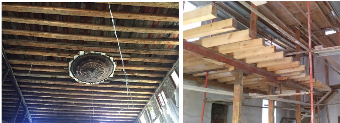
Figure 11. Wooden ceiling beams of main prayer area and women's section [16]

The rotten wooden ceiling coverings of the mosque were removed and the wooden beams and the wooden ceiling core where the ceiling was mounted were preserved. The sections where the wooden ceiling beams were damaged were consolidated (Figure 11) and the bearing system was reinforced. Later, wooden ceiling coverings and laths were rebuilt in accordance with the original. After dismantling the floor covering and ceiling covering of the women's section, the beams bearing the floor layer, the floor covering and the ceiling covering of the women's section were renewed.