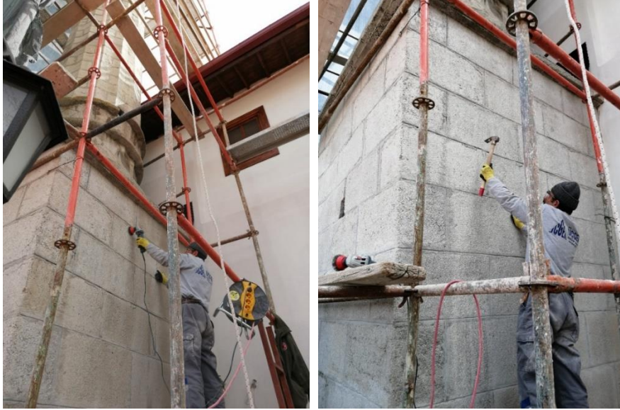
Figure 19. Minaret cleaning and repair work [16]