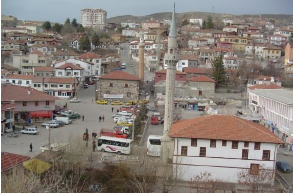
Figure 2. Square of Ayas District, Ulu Mosque and Seyh Muhittin Mosque [6]

Within the scope of this study, the architectural features of the Seyh Muhittin Mosque (Figure 2), located opposite the Ayas Ulu Mosque in the square of Ayas District, were investigated in terms of traditional and monumental architecture by archive research and literature studies. Also, land surveys were conducted on the building and the restoration practices in 2018-2019 were discussed. The survey, restoration and restitution projects of the building were obtained from the Ankara Directorate of Foundations and the restoration applications were examined on site. During these studies, care was taken not to damage the originality of the structure and to make application by evaluating the data obtained.