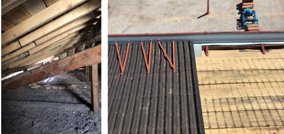
Figure 5. Roof reinforcement and insulation applications [16]

On the roof of the Seyh Muhittin Mosque, the marseille-type roof tiles and decaying wooden cladding boards were removed. The decaying of the carrier pillars and beams in the roof were changed and some of them were reinforced with wooden material. Following the consolidation process, a re-coating board was built and waterproofing was laid and a classical type tile was laid on it (Figure 5).