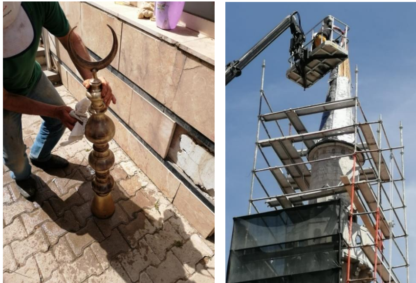
Figure 20. Lead coating in minaret cone and cleaning of finial [16]