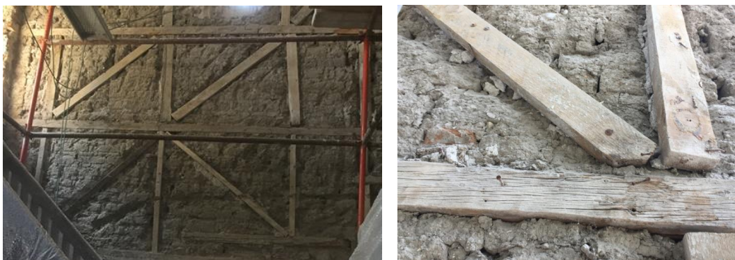
Figure 6. Wood frame irregularities and damage in mud-brick [16]