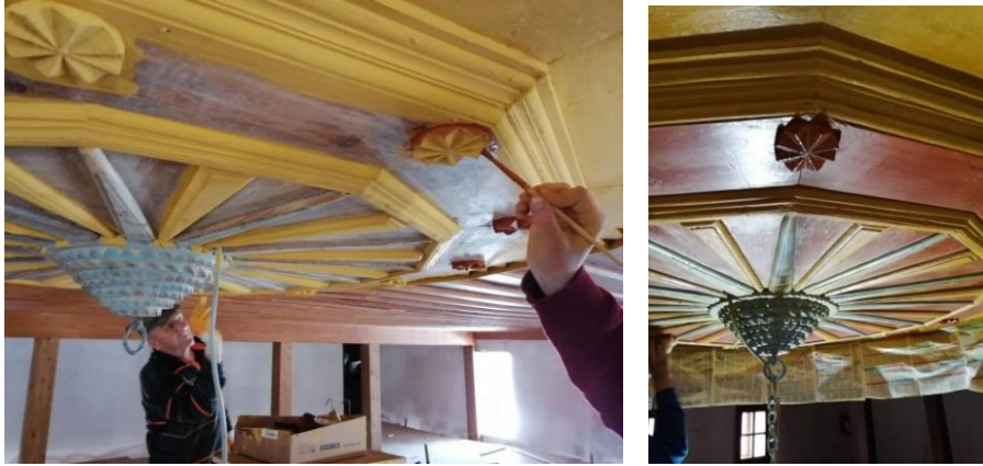
Figure 14. Wood ceiling hub orche paint application [16]