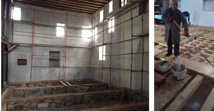
Figure 10. Rubble stone wall and wooden floor beams [16]

The rotten wooden ceiling coverings of the mosque were removed and the wooden beams and the wooden ceiling core where the ceiling was mounted were preserved. The sections where the wooden ceiling beams were damaged were consolidated (Figure 11) and the bearing system was reinforced. Later, wooden ceiling coverings and laths were rebuilt in accordance with the original. After dismantling the floor covering and ceiling covering of the women's section, the beams bearing the floor layer, the floor covering and the ceiling covering of the women's section were renewed.