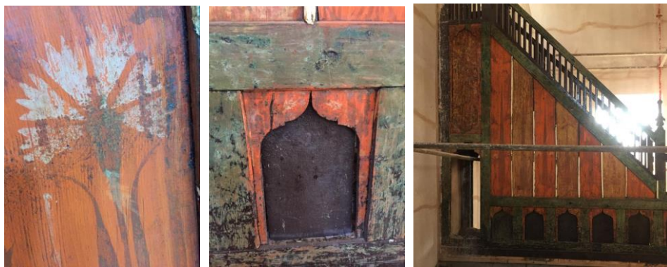
Figure 15. Cleaning the oil paint in the minbar [16]

In the approved restoration project; It is envisaged that the paint layers applied in layers over time prevent the perception of the plaster mihrab motifs to a great extent, and therefore, paint cleaning is performed with suitable methods in order to reveal the original surface. In this direction, firstly mechanical cleaning has started in plaster mihrab. During the cleaning of the paint, different colors of ochre paint were found in the lower layers (Figure 16). For this reason, the cleaning activities were carried out more precisely, paint cleaning was continued with paint remover and scalpel and orche paint was determined in most of the mihrab. After the cleaning works were completed, the fractures and cavities in the mihrab were consolidated by injection (Figure 17). Afterwards, completion and revitalization was done with orche.