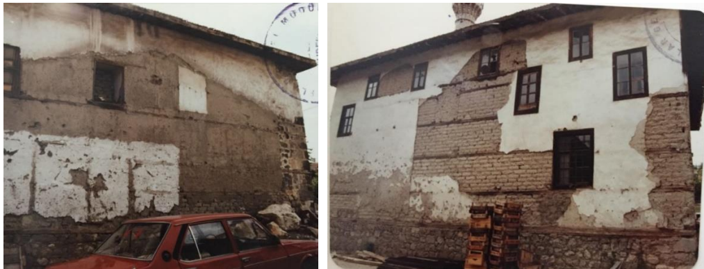
Figure 13. Old exterior photos [9]

Following the start of the restoration work, a research was conducted in the archives of the Conservation Regional Council and old photographs of the building were obtained (Figure 13). In line with the data obtained, the restoration project was revised and the revised restoration project was approved by the Ankara Regional Board of Conservation of Cultural Heritage with the decision dated 06/12/2018 and numbered 6218. According to this project, the wooden door on the left side of the entrance door on the north side of the mosque which was used for the entrance of the women's section was canceled and turned into a window. In line with the data and old photographs, the revision of the east and west facade window system was also carried out. However, an arrangement was not made in the southern facade window system where sufficient data could not be obtained.