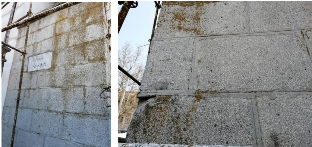
Figure 18. Algae and cement residues on the surface of the minaret [16]

The metal coating in the minaret cone was removed and the stability of the wooden coating under the cone was checked and the wood was impregnated and reinforced. Then the lead was coated on the cone. The copper finial in the cone was removed and cleaned and assembled in place by applying protection (Figure 20).