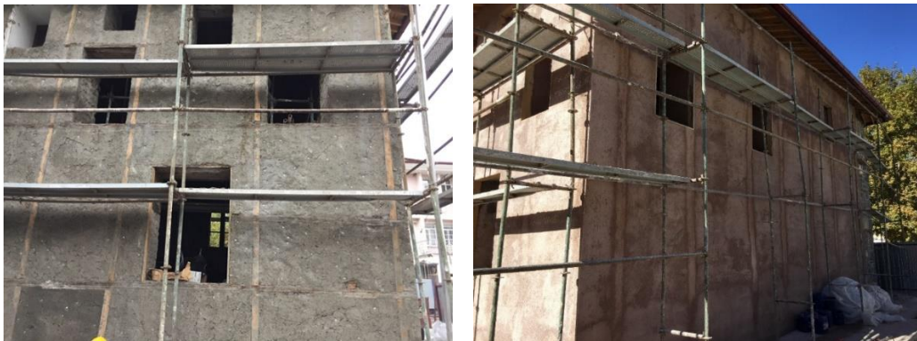
Figure 9. Metal lath and plaster application on walls [16]

In accordance with this decision, complements were made by using mudbrick material, rotting horizontal and vertical woods were renewed and the protected ones were strengthened by impregnation. Mudbrick is a building material obtained by mixing straw or other additives into clay and suitable soil, kneading with water, pouring into molds and shaping and drying in the open air [17]. Following the consolidation of the structural system, metal lath was applied to the mudbrick surfaces and the integration and consolidation of the plaster to the surface was realized (Figure 9).