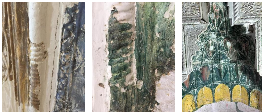
Figure 16. Mihrab cleaning works [16]

In the approved restoration project; It is envisaged that the paint layers applied in layers over time prevent the perception of the plaster mihrab motifs to a great extent, and therefore, paint cleaning is performed with suitable methods in order to reveal the original surface. In this direction, firstly mechanical cleaning has started in plaster mihrab. During the cleaning of the paint, different colors of ochre paint were found in the lower layers (Figure 16). For this reason, the cleaning activities were carried out more precisely, paint cleaning was continued with paint remover and scalpel and orche paint was determined in most of the mihrab. After the cleaning works were completed, the fractures and cavities in the mihrab were consolidated by injection (Figure 17). Afterwards, completion and revitalization was done with orche.