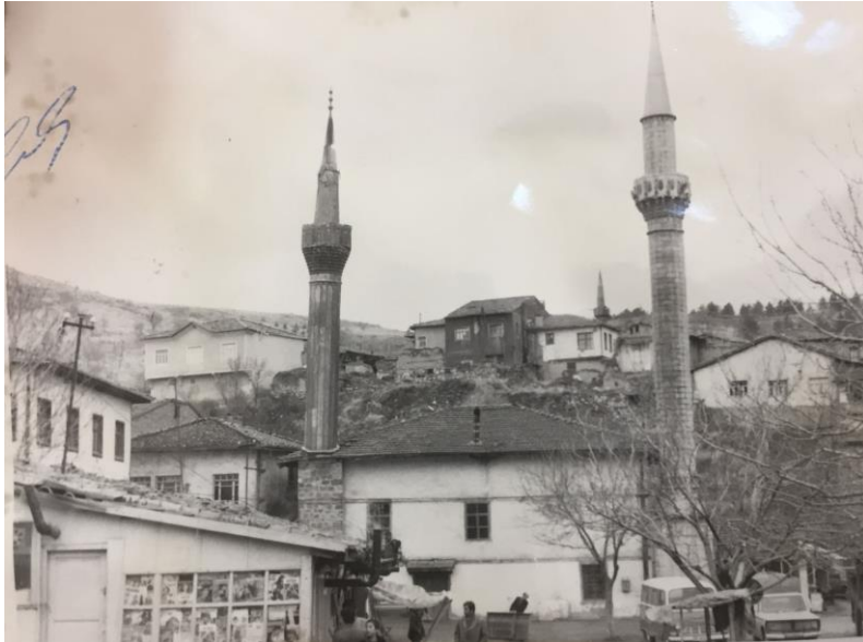
Figure 3. Ayas Seyh Muhittin Mosque wooden and reinforced concrete minaret [9]

The mosque has a wooden ceiling and a low relief, geometric inserts, plaster mihrab (Figure 4) and a wooden minbar between the two windows [8]. On the slatted wooden ceiling, there is a ceiling hub which is found to be painted with ochre (Figure 4).