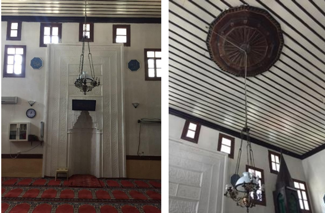
Figure 4. Plaster mihrab and wooden ceiling hub [7]