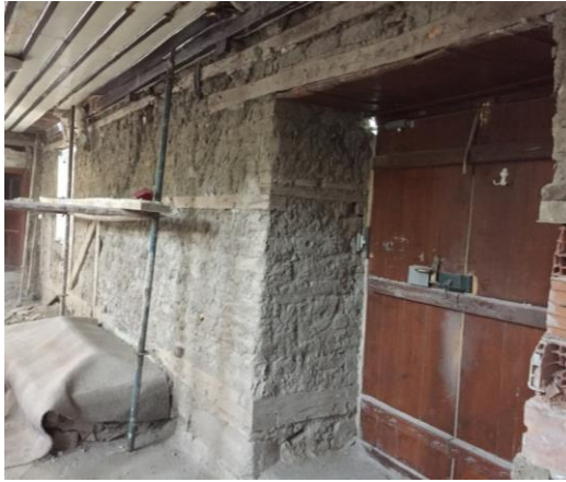
Figure 7. Uncrossed sections [16]